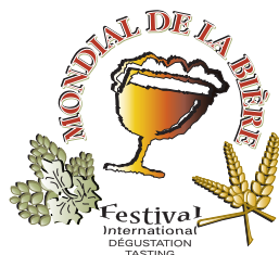
TABLE OF CONTENT BEER AND OTHER ALCOHOL