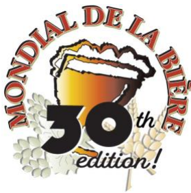
TABLE OF CONTENT BEER AND OTHER ALCOHOL